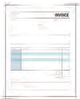
Vendor invoices are identified, and data located.